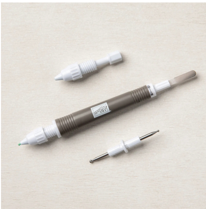
Take your pick Tool