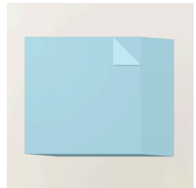
Balmy Blue Cardstock