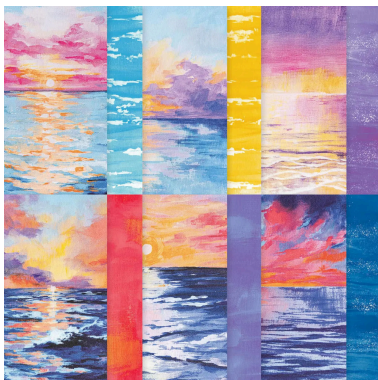
Sunset Coast 6x6 paper