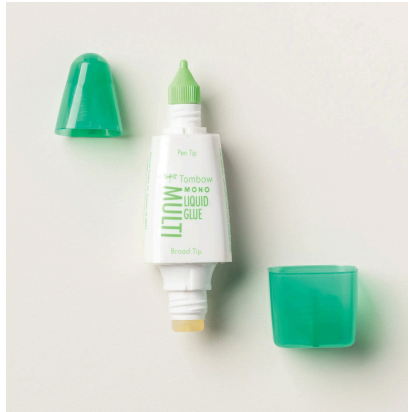
All Purpose Glue