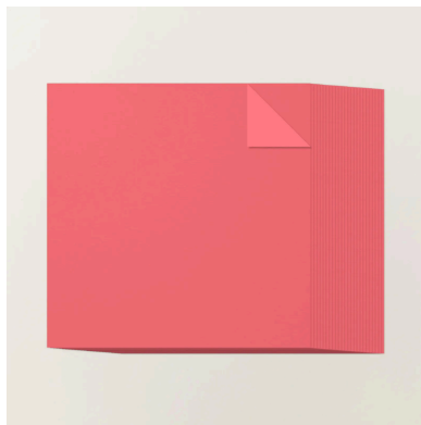
Strawberry Slush Cardstock